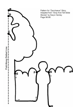
Pattern for Bible Lesson